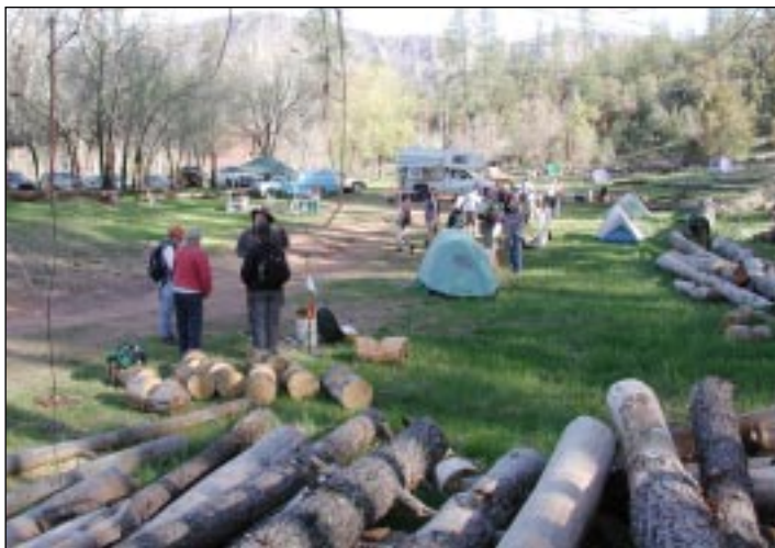
Crew assignments at the campsite prior to heading up the Highline Trail.