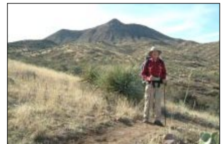
11/24/03 Antelope Peak in background