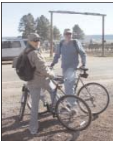
Bikers took self guided tours of the area all weekend long.