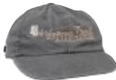
AZ Trail BALLCAP