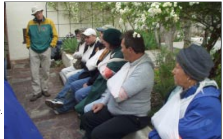
On the beautiful Kannally Ranch patio at Oracle State Park, simulation patients await critique of the casts and slings applied for an elbow break.