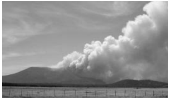
Lightning caused Pumpkin Fire on Kendrick Mountain on the Kaibab and Coconino Forests.

During June, 10% of the Tonto National Forest, 52% of the Coconino National Forest, and 83% of the Kaibab National Forest, were closed to public access. Virtually all public lands were under fire restrictions, which prohibit campfires, charcoal grills, and smoking outdoors. What did this mean for trail users? Trails and forest roads within the closure areas were off limits. While late to arrive, the monsoons finally brought much needed rain. This brought relief to all who feared a repeat of the Los Alamos and Montana fires in Arizona.