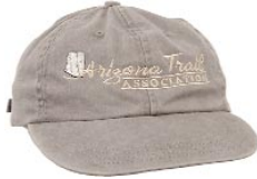
BALLCAPS Original and New