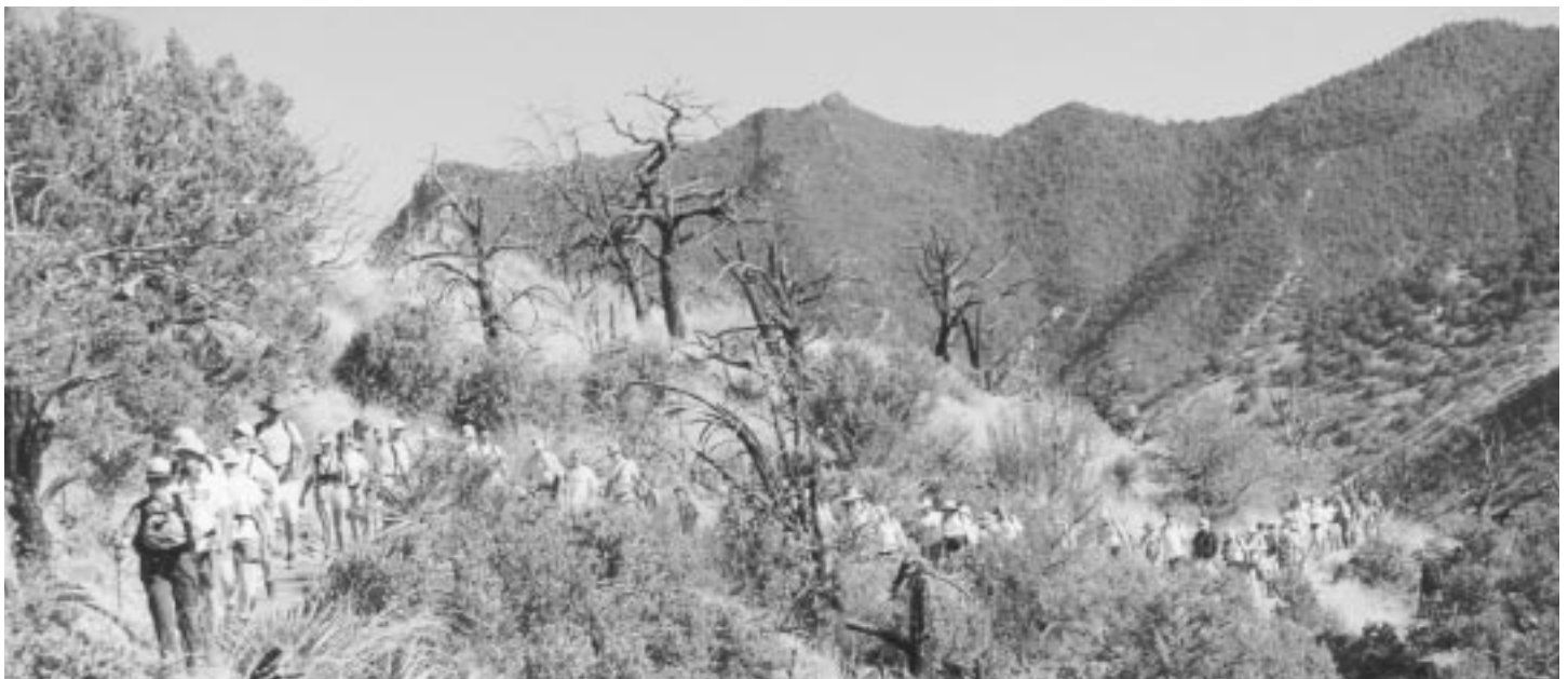
Hikers celebrate National Trail Day 2000 along Joe's Canyon Trail in Coronado National Monument