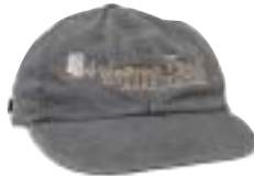
AZ Trail BALLCAP