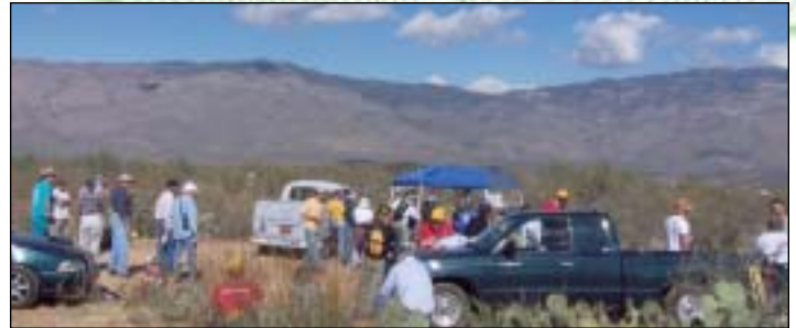
With the scenic Rincon Mountains in the background, volunteers enjoy lunch after building a mile of trail on Tucson Electric Power Day, Nov. 13.

At this writing, the trail is complete from the start at Rincon Creek in the north to Colossal Cave Park. Construction inside the park, where there are some steep topography issues, is projected for completion by the end of January. In the meantime, volunteers are continuing to build trail south of the park, so by the time the park section is completed there should be close to 10 miles of new contiguous trail.